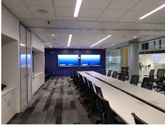
Dual TVs in Room B

(785) 532-4643 support@engg.ksu.edu http://cecs.engg.ksu.edu