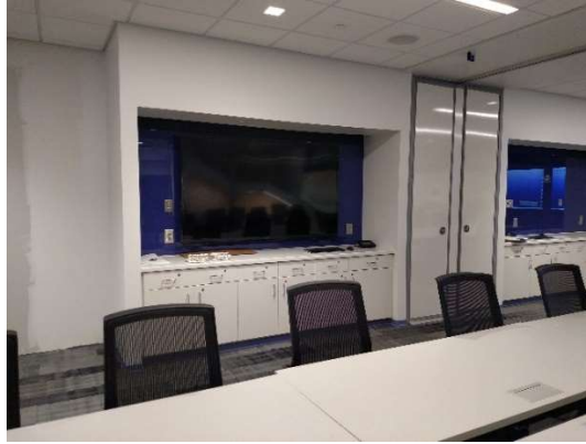
TV in Room A