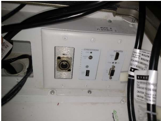
Floor Box Inputs