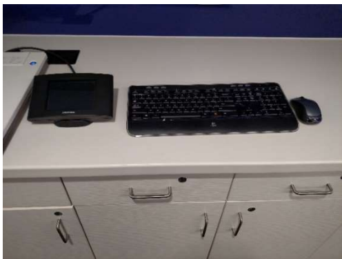
Controller Pad, keyboard & mouse

Please see reverse side for additional instructions.