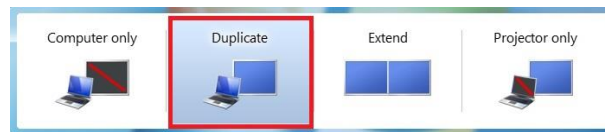
Windows System Display Mode