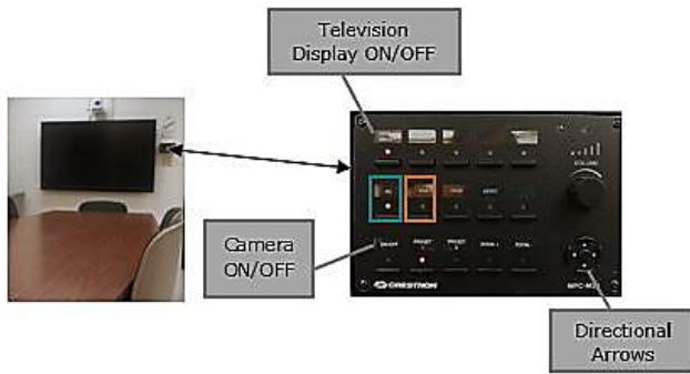
Crestron Control Panel and Location