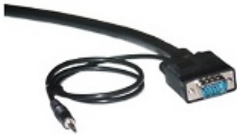
VGA and Audio Cable