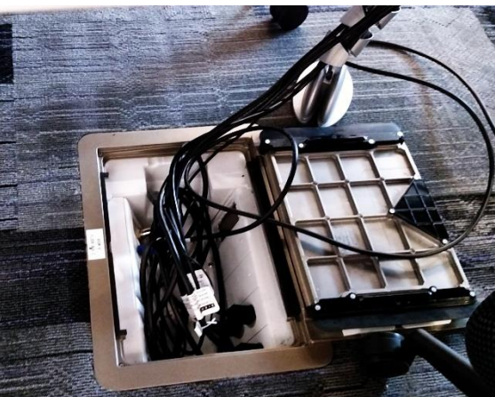
Floor Box connectors

The top of the screen will show you if the room is combined. In the above images it just shows Room B. If it was combined it will say Room A + B.