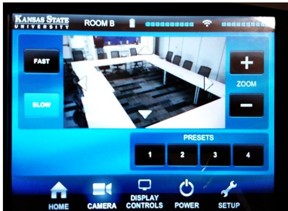
Camera tab screen