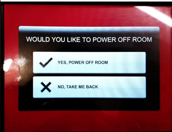
Power tab screen