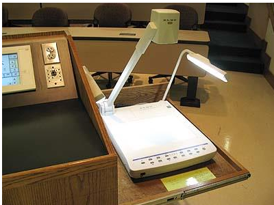
ELMO (Document Camera)